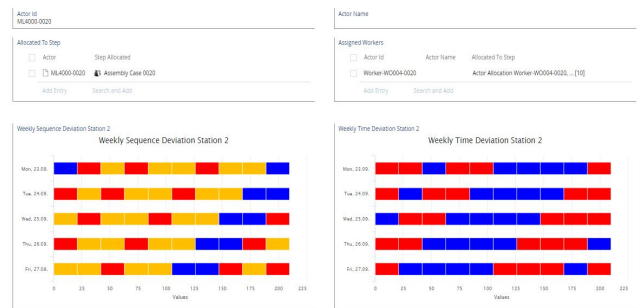
Fabasoft Cloud-based Process Deviation Feedback Interface

The approach requires merely standard sensory infrastructure on the assembly floor such as weight-sensitive part boxes or pick-by-light systems. Process progress information is provided back in near real-time via a cloud-based solution hosted by Fabasoft.