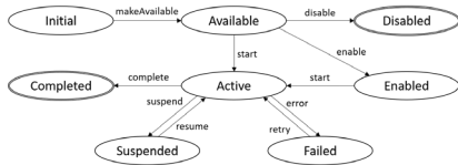
Assembly step progress model

The research approach conducted jointly by the research and industry partners builds on a combination of multiple models: an assembly process model describing the optimal order of assembly steps; a constraint model describing which step dependencies cannot be physically violated; and a runtime model describing which steps could be