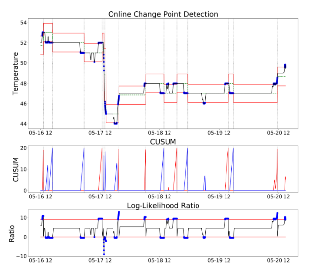
Figure 2: Results Changepoint Detection – The developed CUSum algorithm is able to detect changes in the environment, enhancing a PLC with contextual awareness

The results demonstrate how environmental awareness can be established in legacy automation systems using affordable IoT equipment. By utilizing a minimal set of additional hardware such features can be implement allowing for a wide range of additional services such as condition monitoring thus leading to a further cognification of automation systems.